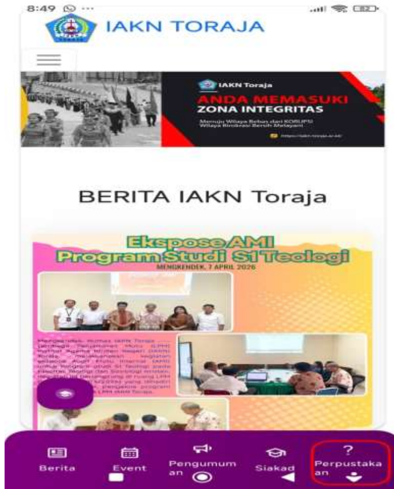
opac terpasang di website institusi versi android